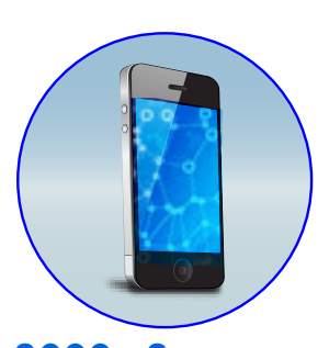
3000+ Sponsor Impressions on the conference mobile app